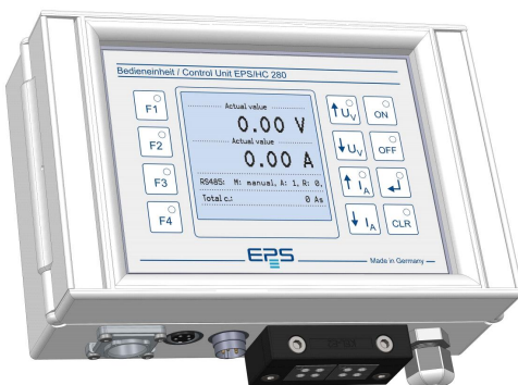
EPS/HC280 Control Panel